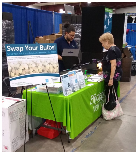
A bulb swap event for Efficiency Vermont in 2019

During our early days of selling lighting, we kept running into the same issue when talking with customers about upgrading – they had a hard time replacing perfectly good light bulbs. As New Englanders adept to Yankee frugality from our upbringings, we get it and know where customers are coming from. We always knew it'd be an uphill battle to do bulb swaps, especially with polarizing technology.